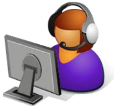
Customer Contact Center Triage and Referral Nurse