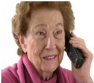
Patient Calls With a Concern....